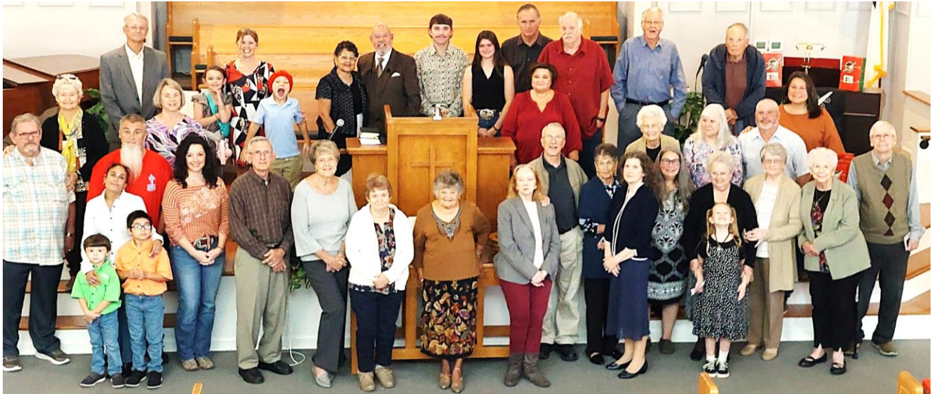
The Foreman Memorial Baptist Church Family, picture taken Sunday, October 19, 2025 (A few got away before the picture was taken, but this was almost everyone!)